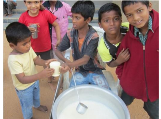
Keen Customers at Child Haven in Hyderabad, India

Haven continues to operate SoyCows at 8 homes primarily in India but also one each in Nepal and Bangladesh. Some of the SoyCow systems have been in operation for 15 years. Children receive two cups of fresh soymilk daily, once at breakfast and once after school. These homes range from about 50 children to