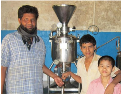
Child Haven SoyCow at Chittagong, Bangladesh

The first SoyCows, which were built in Canada by ProSoya, were sponsored by Child Haven International and funded by Canada's International Development Agency (CIDA); they were installed at their homes for children and destitute women in India in 1990-92. In all, 12 systems were funded by this Canadian government grant. MM principals working as volunteers, together with ProSoya, managed this first program. Today, Child